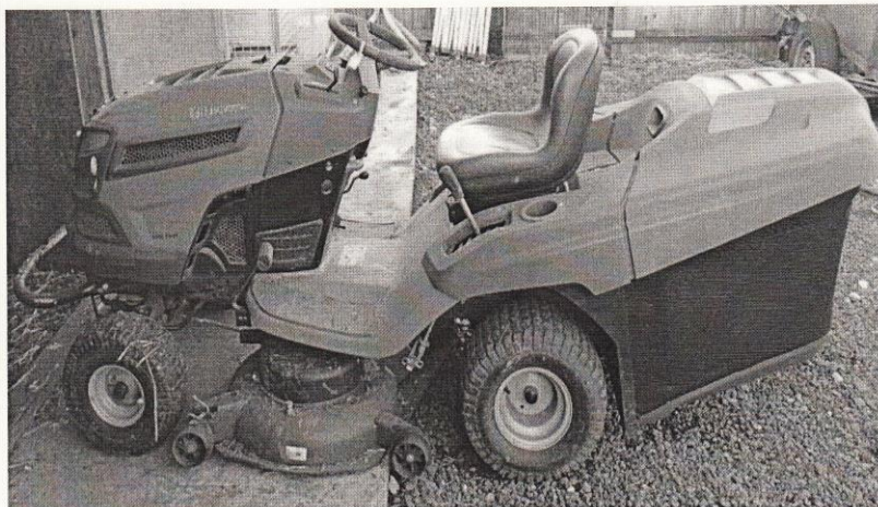
Stolen lawn mower at puppy farm

Four people were arrested; two for Fraud and Animal Welfare, one for Fraud, Animal Welfare and Cultivation of Cannabis and one for Fraud, Animal Welfare, Cultivation of Cannabis and Theft in relation to the lawn mower.